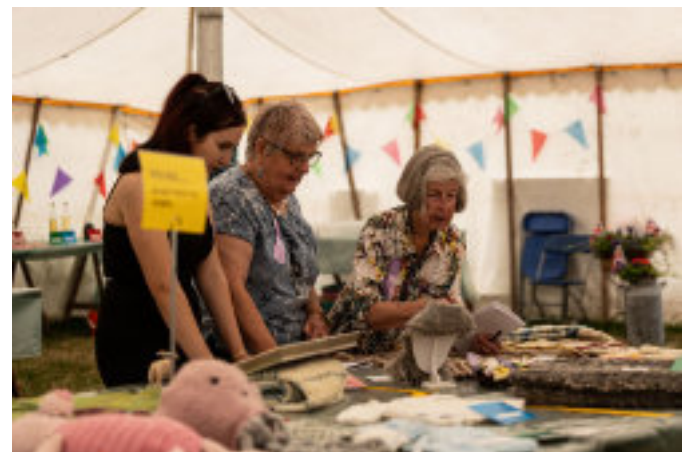
The Horticulture area had over 1300 entries across the 243 different classes

The physical build up to the show in July is always an intense time and this year it went very smoothly despite poor weather the weekend before, which is a key time. Careful planning and hard work earlier in the set-up phase meant our own preparations were largely complete two days before the show – a new record. It also meant that we were able to welcome our exhibitors and traders to a showground that was