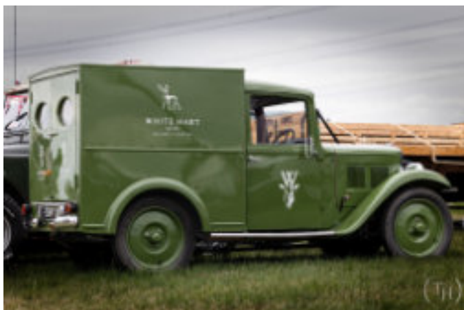
The White Hart Hotel, Lincoln were a main sponsor this year of the Area Trial Showjumping event