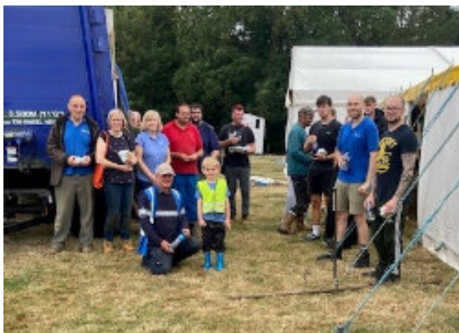
The Horticulture marquee was set up and ready in record time, thanks to an army of volunteers

That planning included making sure we had strong teams for all the key tasks. A particular success was a new team of mainly young people who fitted out the horticulture tent on the Saturday morning the week before the show – a task that normally takes 2-3 days. The enthusiasm and commitment of the next generation bodes very well for the future of the show.