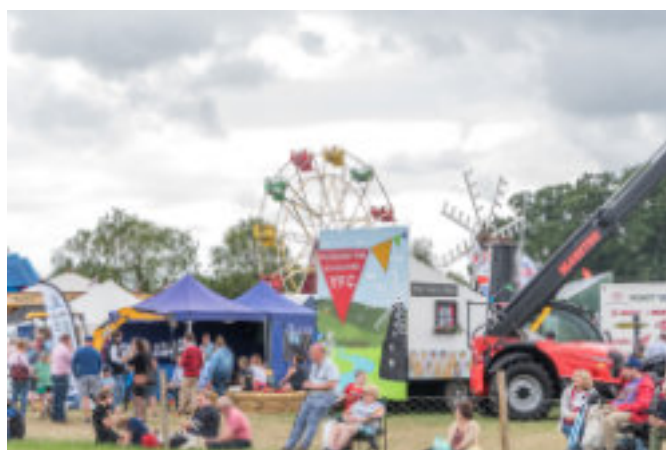
Heckington & District Young Farmers Club attended with their winning float from this year's Lincolnshire Show