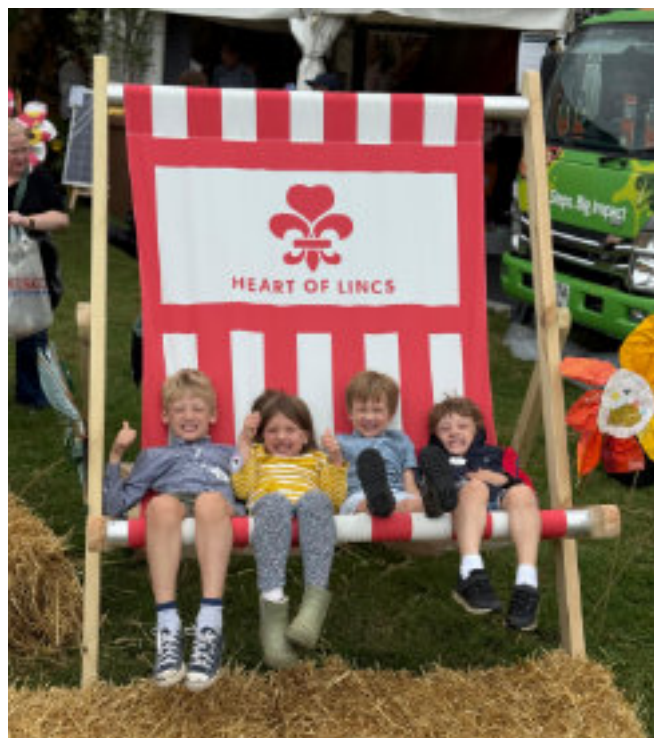
Sponsors included North Kesteven District Council who put on an amazing show on their stand include a sandy beach and giant deck chair!