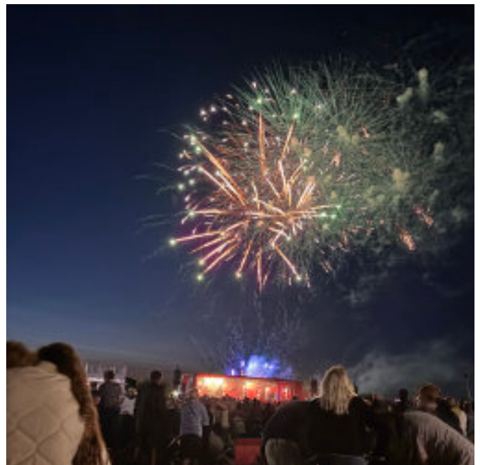
The firework display ended Saturday evening in spectacular style