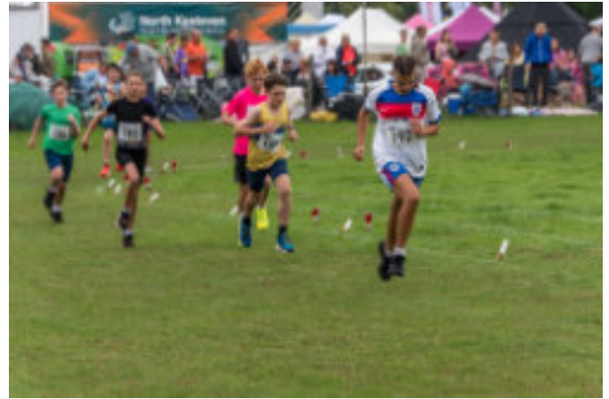
Youth athletics races were well attended with competitive teens competing for the Denman Cup

And that leads to the question of what it is about the Show that creates that atmosphere. My own view is that it springs from three things. Firstly we are all agreed that there is only one thing that matters – how do we put on the best show. Next, we acknowledge that we may have different views on what that means but we are all prepared to work respectfully and patiently to get to good results that all support. Finally, we are all here not for personal benefit or recognition but to serve our community as best as we possibly can.