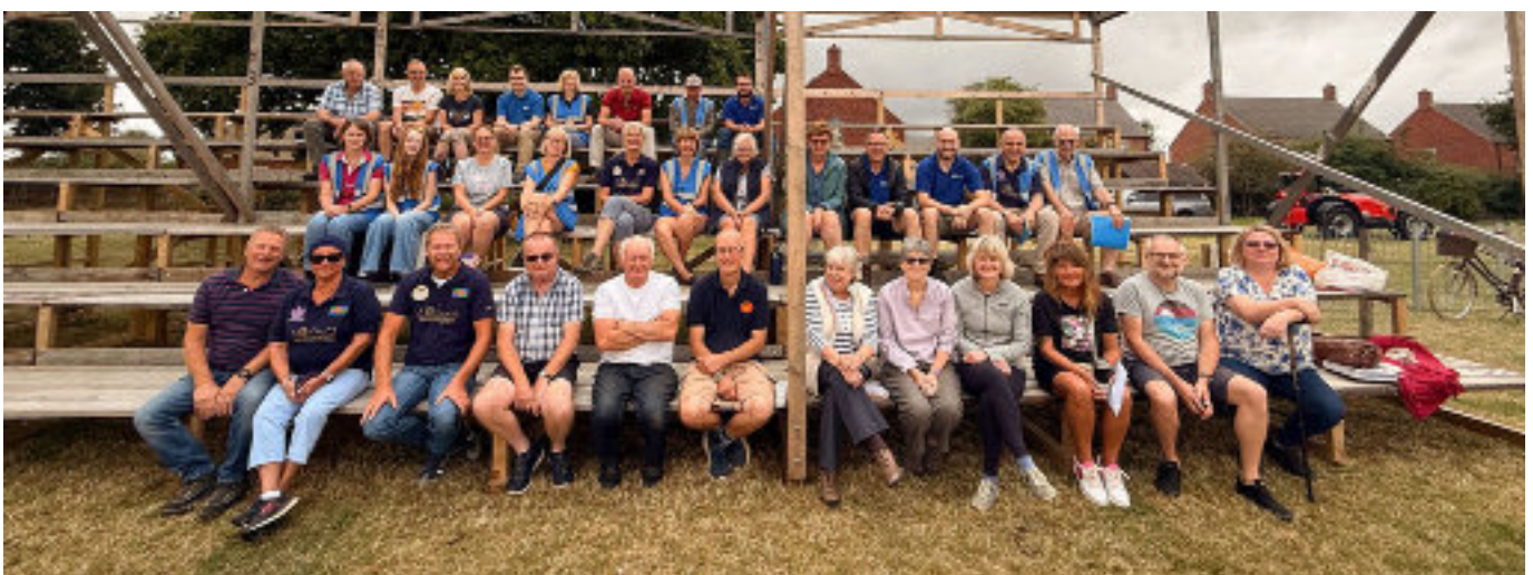
Some of the committee members and helpers at the Health & Safety briefing before the Show