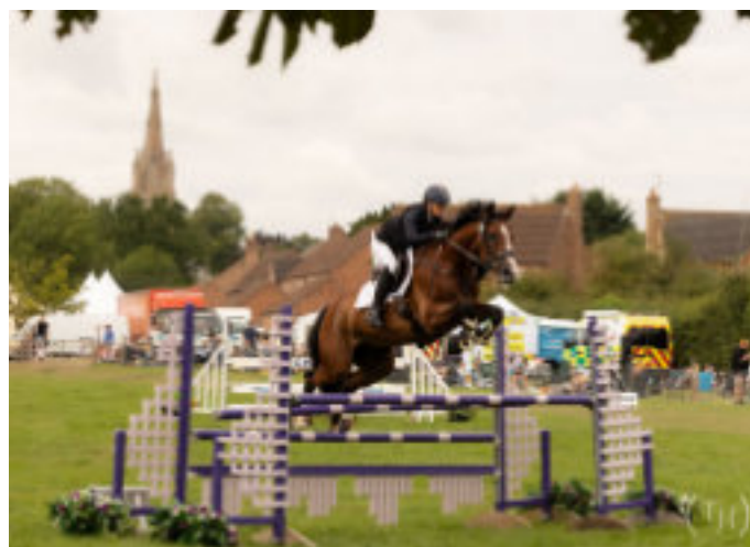
Showjumping competition was high, with competitors praising the quality of the grounds

The reserves are held at this level as a protective measure in case the costs incurred in preparation for a show are not met by income due to bad