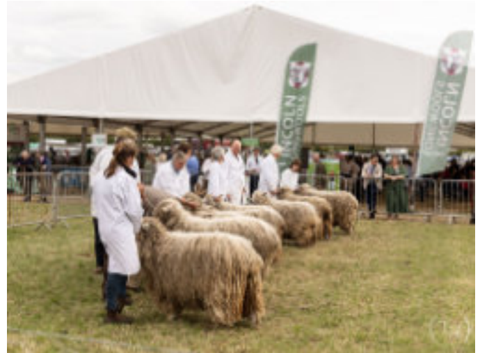
This year saw record entries in the sheep section, with strong entry numbers in the Lincoln Longwool classes

The numbers this year were undoubtedly good but the show was successful in less obvious ways but equally important for its long-term success and prosperity. The feedback this year was tremendously positive – do take a moment