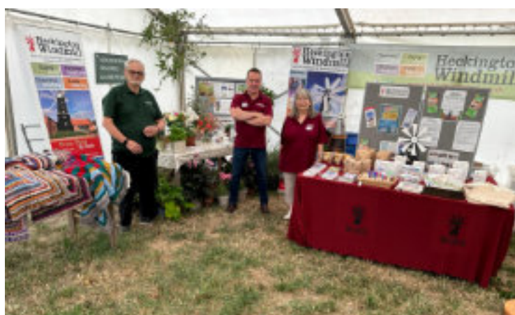
Heckington Windmill's display in the Heritage Village, was one of many local and community groups at the Show