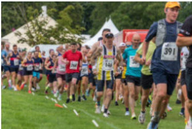
This year marked a record number of entries into the 10 Mile Road Race with 450 competitors and a waiting list for places

The show was a success financially too. We have now fully recovered the losses suffered due to poor weather and Covid between 2017 and 2022 meaning our reserves are stronger than ever before.