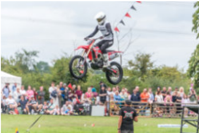
The main ring attractions drew large crowds to the arena, with FMX Stunt Motorcycles just one of the main attractions

fully-prepared for them, making their own set up easier and more relaxed as well as enhancing the reputation of the show as organised and friendly.